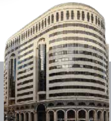
Frontal Al Harthia