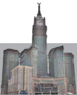
Al Safwa Royal Orchid